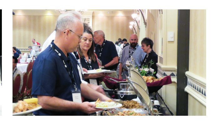
The Hilton Naples prepared some delicious food for the hungry building science attendees