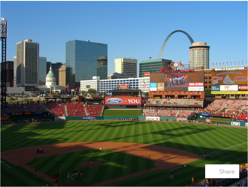
Fans of the St. Louis Cardinals can catch glimpses of the city's iconic skyline right from their seats inside Busch Stadium.