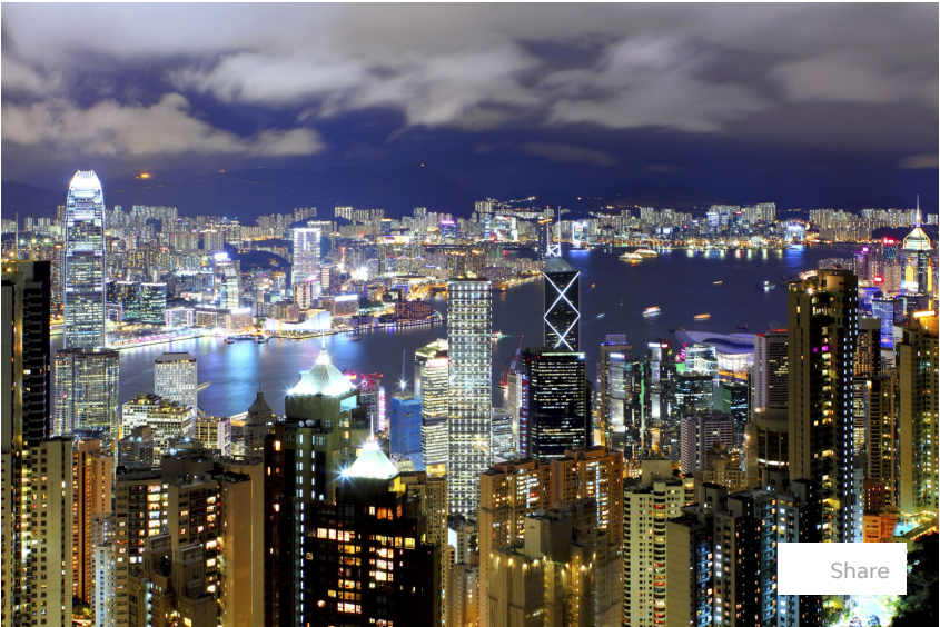
"The Hong Kong skyline has two key elements which make it special." explains