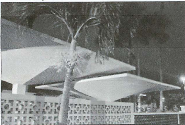
Concrete hyperbolic paraboloid parking pods and ornamental block and textured brick perimeter wall give street appeal.

"CANTILEVERED CONCRETE 'EYEBROWS' DELINEATE EACH FLOOR AND CREATE HORIZONTAL LINES THAT REDUCE THE PERCEPTION OF ITS HEIGHT."