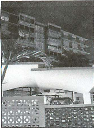
Night view showing "eyebrows", stacked balconies, and flood-lit parking structures.

"CANTILEVERED CONCRETE 'EYEBROWS' DELINEATE EACH FLOOR AND CREATE HORIZONTAL LINES THAT REDUCE THE PERCEPTION OF ITS HEIGHT."