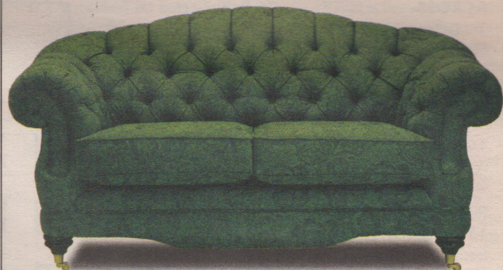
Chartwell 2-seater sofa

Now sit down and we'll tell you the shop price