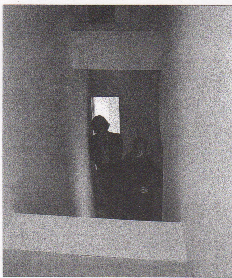
Azman Owens Architects: Publicity has yielded a string of celebrity clients.

The practice is now working at Canary Wharf and has been recommended for a new, large West End restaurant.